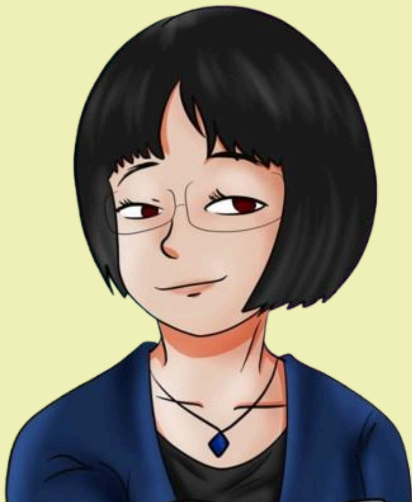
Original Creator Kanata Konami